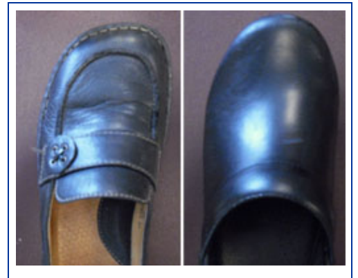
Wear shoes and socks that fit and give your toes plenty of room.