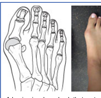
A bunion is a bony knob that protrudes from the base of the big toe.

up and if you have your foot in a tight shoe, it will rub up against the shoe surface and cause pain. In addition, the muscles that attach to the toes will continue to weaken if the foot stays in this abnormal position.