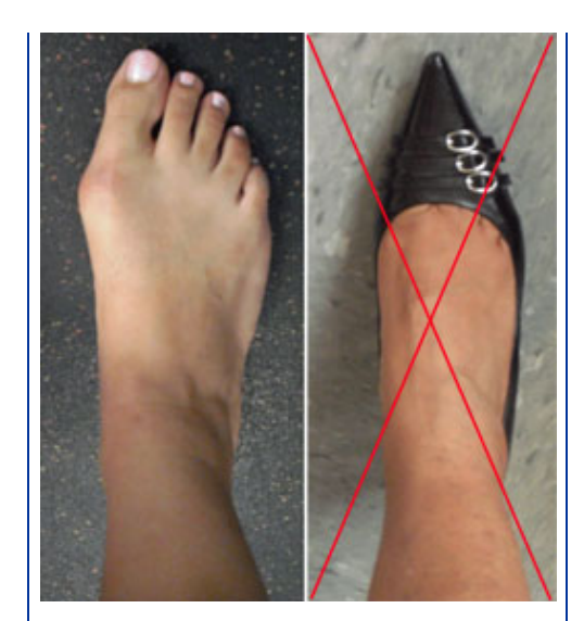
The goal is to find a shoe that approximates the shape of your foot - rather than for your foot to take on the shape of the shoe.

• Shoes that do not have the tongue attached to the upper of the shoe will provide a better fit. It is difficult to add an extra insole or orthotic to a shoe with the attached tongue.