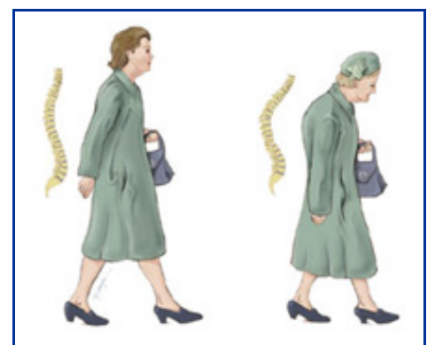
Loss of height and a stooped appearance of a person with osteoporosis results from partial collapse of w eakened vertebrae.

radiographic absorptiometry, and ultrasound. Your doctor can determine which method is best suited for you.